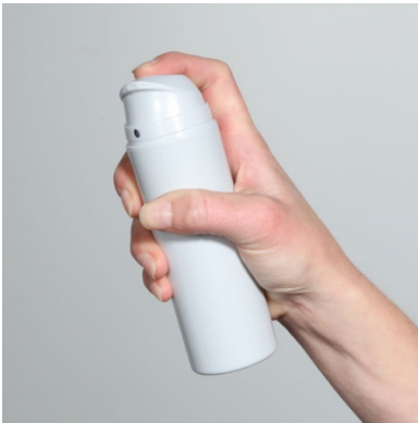
Figure C: Hold can upright and press nozzle firmly to dispense.