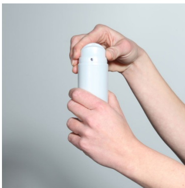
Figure B: Line up the black circle with the nozzle.