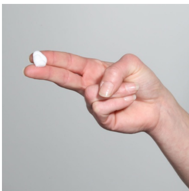
Figure G: Pick up a small amount of EVOCLIN Foam on your fingertips and gently rub into the affected area until the foam disappears.