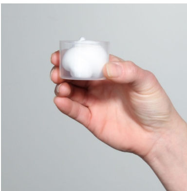
Figure E: Dispense enough EVOCLIN Foam to cover affected area.