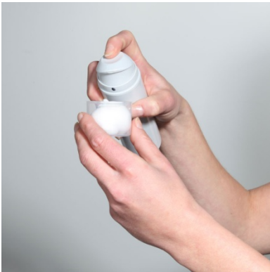
Figure D: Dispense EVOCLIN Foam into clear cap.