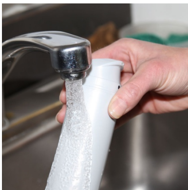
Figure F: If the can seems warm or the foam is runny, run the can under cold water.