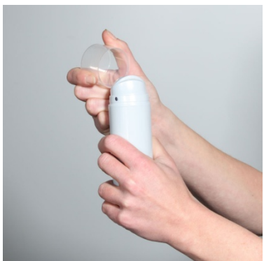
Figure A: Remove clear cap.